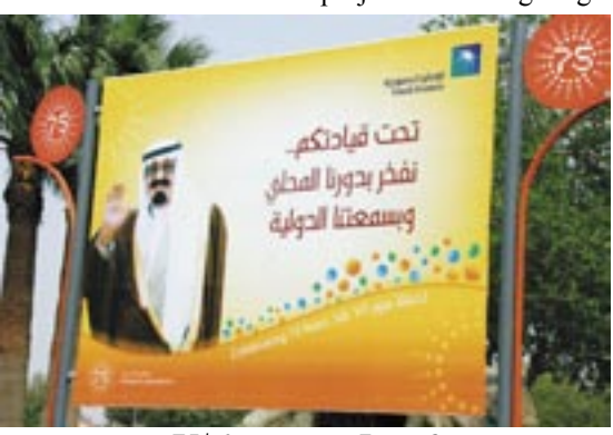
75<sup>th</sup> Anniversary Event Sign