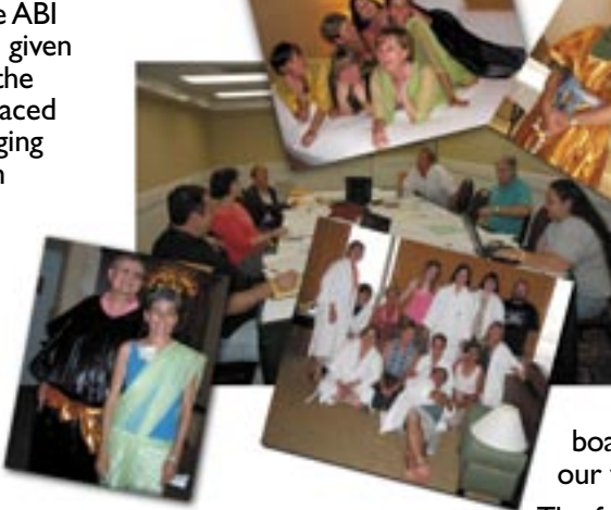
ABI Board Hard at Work

from, and to ensure that our board has skilled volunteers for the appointed slots. Being part of the ABI requires a serious commitment of time, patience and effort. In return you will receive a lifetime of memories and the satisfaction of knowing that you helped keep this dream alive.