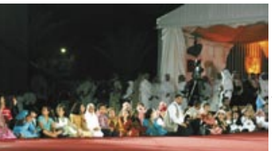
Aramco Children waiting to perform for the King during the 2008 Anniversary Celebrations.

In addition to the Saudi Aramco-sponsored celebrations, the "children of yesteryear" were entertained by our Saudi friends at private dinner parties and other social events. This was indeed, by all accounts, a celebration to remember!